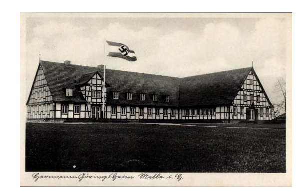
Figure 3. A postcard illustrating Hermann Goring Heim, https://www.akpool.co.uk/postcards/ 26032529 - postcard -moelln-in-schleswig-holstein-hermann-goering-heim

In Nuremberg, the Hauptmarkt is the historical city center, due to its symbolic meaning, it was chosen for parades and rally related activities. But for Nazi "traditional" aesthetic preference, the building style around the square was not enough "original" in the German context. For example, according to Heinrich Hohn who is a staff member of the German National Museum, the neo-gothic building right beside the cathedral is an "unbearable foreign body" that