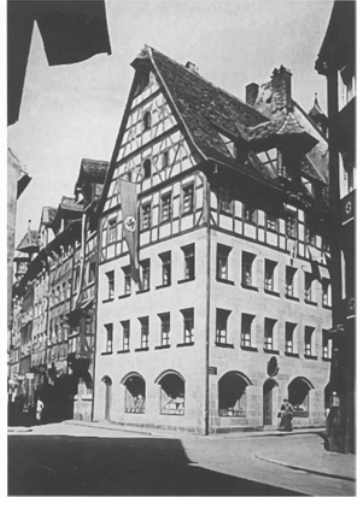
Figure 5. Building on Ebnersgasse, before and after "restoration", Joshua Hagen

disturbed the square's medieval charm. [10] Therefore, with the support of people who were motived by the national pride, a process of architectural palimpsest in the name of "restoration" started.