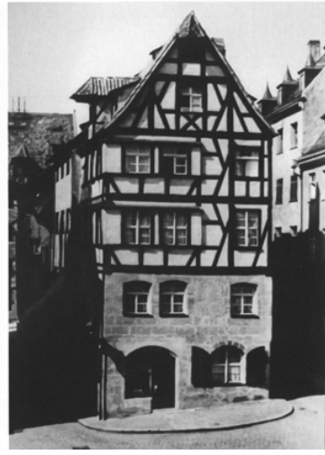
Figure 4. Telegraph Building, before and after "restoration", Joshua Hagen